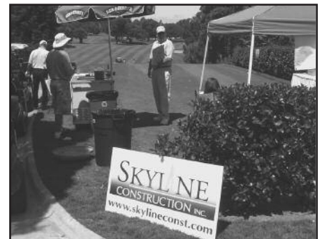
Skyline Construction's Ice Cream, Cigar & Tequila Hole