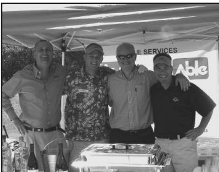
The Able Services Gang