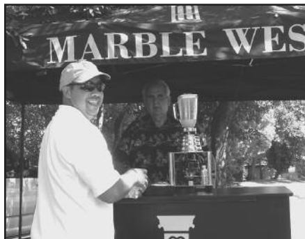
Marble West's Shrimp & Margarita Hole

AS ALWAYS, THANKS TO BOMA'S 2006 PLATINUM SPONSOR... ABLE SERVICES!!!!