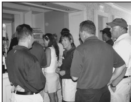
Golfers enjoying the 19th Hole