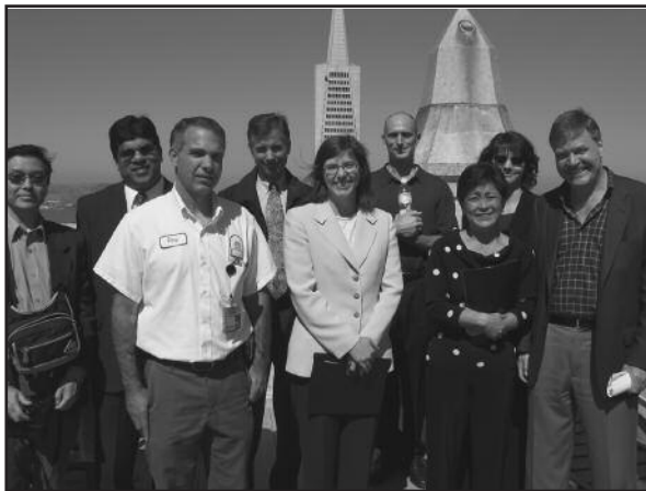
BOMA members enjoy a rooftop view from the Russ Building tour in September 2005.

The tour is scheduled for Tuesday, October 24. There is no charge for the tour, however, participation is limited to 20 people per tour, and available on a first-come, first-served basis. You must RSVP to Tory Brubaker at 415-362-2662 x15, toryb@boma.com.