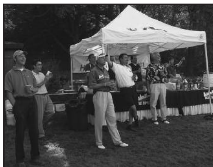
August Supply's Hurricane Hole