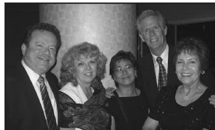
BOMA SF members at the Toby Awards Banquet