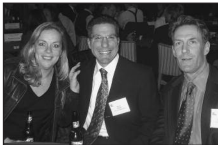
The competition begins