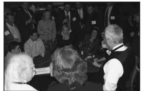
The finalist's table