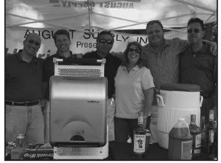
August Suppy's Hurricane Hole.