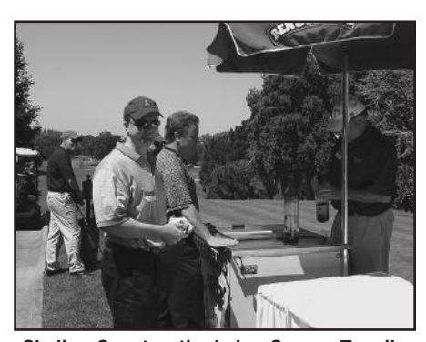
Skyline Construction's Ice Cream, Tequila & Cigar Hole.