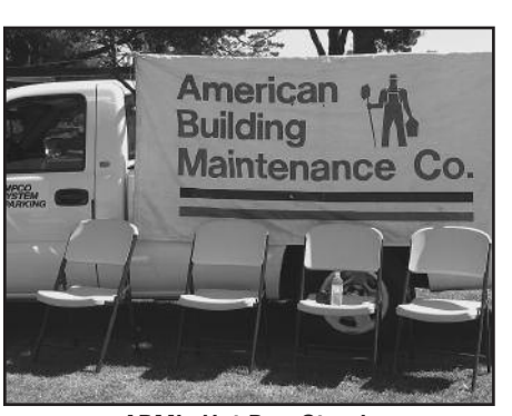
ABM's Hot Dog Stand.